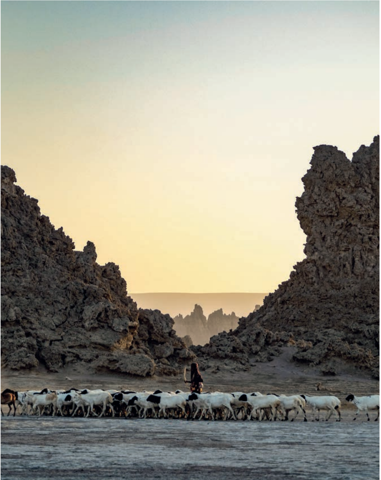
Djibouti, in the Horn of Africa, entirely relies on groundwater. An EIB-financed desalination plant will benefit the country's people and livestock.