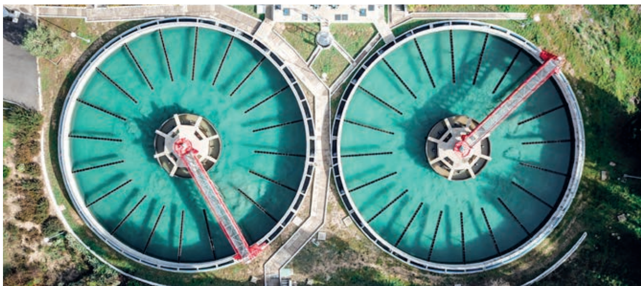
Modern wastewater treatment protects public health and the environment. The EIB finances treatment plants in and beyond the European Union.

With total water and wastewater-related financing of more than €86 billion since the early 1960s, the EIB is one of the largest lenders to the global water sector. To date, it has supported over 1 770 water projects. From an early focus on building or upgrading sanitation and drinking water infrastructure, the Bank has expanded its portfolio to include projects in areas such as flood risk reduction, erosion prevention, new water supply (including desalination), new water-related technologies and revitalisation of watercourses.